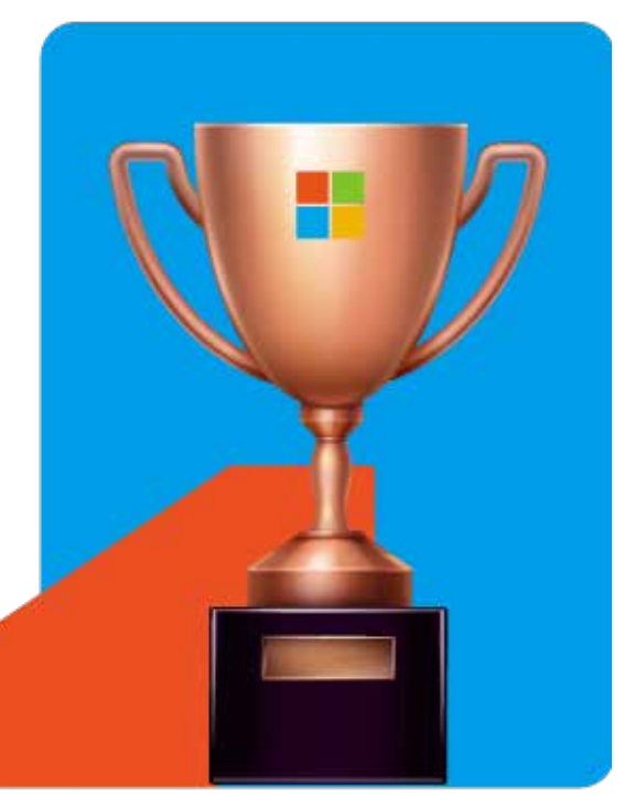
Digital & App Innovation